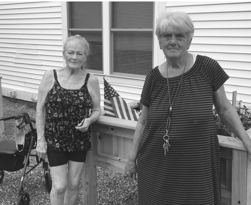
A few of the Moorings residents who have found the free ride service to be “so very helpful”.

Grocery stores and food banks, non-food bank, pharmacies, Doctors and Dentists, and a local bank stop can be made along with eligible rides